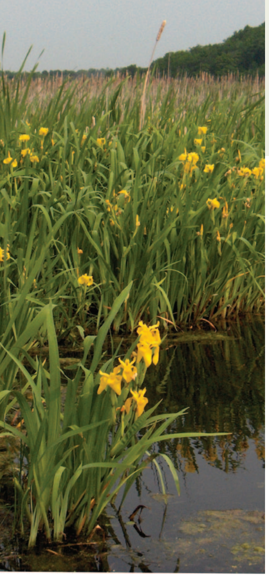
Yellow iris can form dense stands with very thick mats of rhizomes.

Yellow iris, or yellow flag iris, is a perennial aquatic plant native to Europe, western Asia and North Africa. It was first introduced to North America in the 1800s as an ornamental plant for ponds and water gardens. The plant has since spread to many waterways, including those in parts of southern Ontario. In addition to its use in gardens, it has been planted in wastewater ponds because it is known to absorb heavy metals.