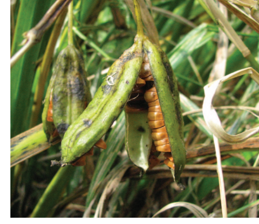
Seeds are closely packed in rows.

When not flowering, yellow iris looks similar to the native blue flag iris ( Iris versicolor ). Blue flag iris is usually smaller, with leaves 10 to 80 centimetres long, stems 20 to 60 centimetres long, and purple-to-blue flowers. Yellow iris leaves may also be confused with other wetland plants, such as cattails ( Typha spp.) and sweet flags ( Acoraceae spp.).