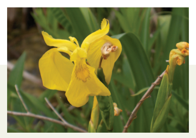
Yellow iris have three drooping, deep-yellow sepals with purple-brown markings.