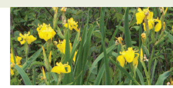
Flattened leaves up to one metre long fan out from the base.

The first recorded Canadian sighting of yellow iris was in Newfoundland in 1911. It was found in Ontario in 1940. Today it grows in most Canadian provinces, including parts of southern Ontario, Quebec, Nova Scotia, Newfoundland, New Brunswick, the east coast of Prince Edward Island and the west coast of British Columbia. It is also found in many American states, and in temperate areas worldwide. Several American states ban it or list it as a noxious weed.