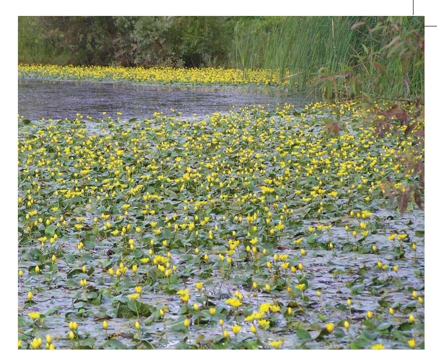
Yellow floatingheart.