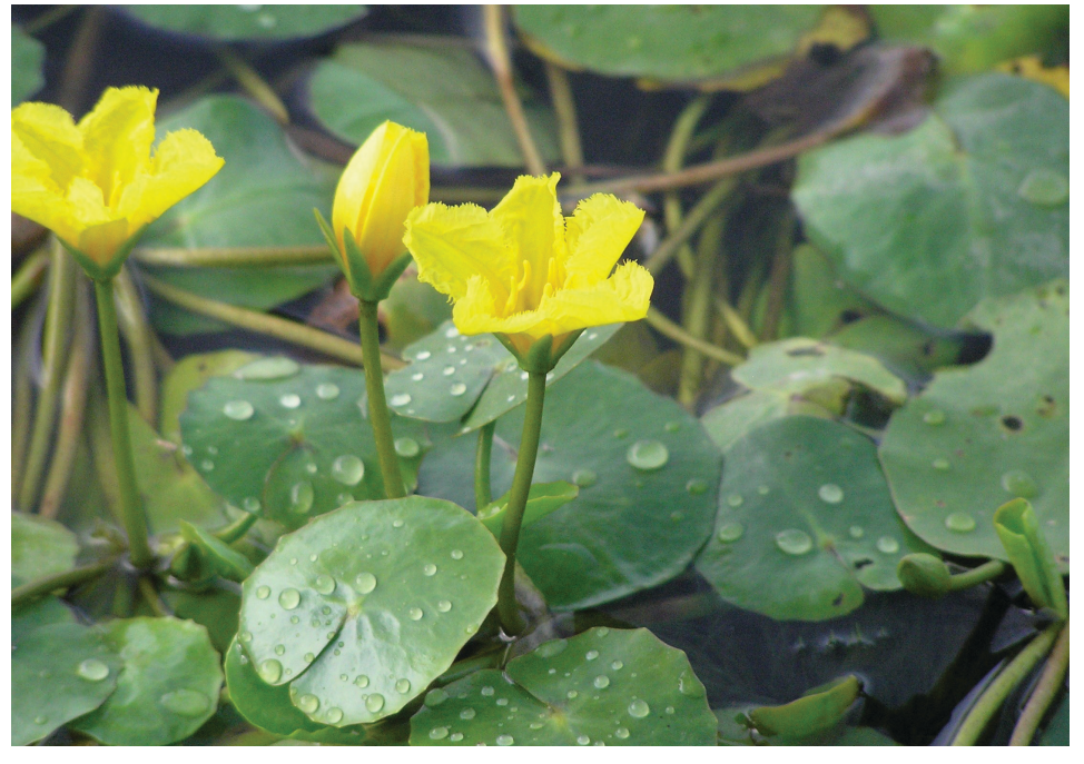
Yellow floatingheart.

Currently, there are very few populations of yellow floatingheart in Ontario, but this plant has been found growing in ponds in Sudbury, ON as early as 1942 and at Turkey Point, ON as early as 1953. The plant has also been recorded in the Royal Botanical Gardens and reported in Ottawa (several ponds), including Brown's Inlet. The species has also been reported in the Belleville, ON area.