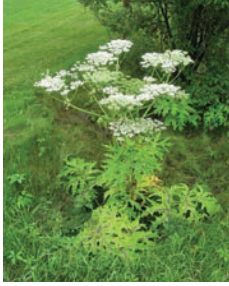
Diana Shermet, CLOCA