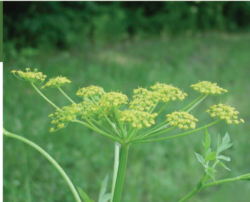
Flowers grow in yellowish-green clusters

In North America, scattered wild parsnip populations are found from British Columbia to California, and from Ontario to Florida. It has been reported in all provinces and territories of Canada except Nunavut. The plant is currently found throughout eastern and southern Ontario, and researchers believe it is spreading from east to west across the province.