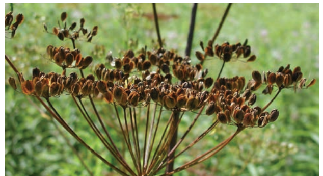
Yellowish-green flowers turn into round, flat brown seeds