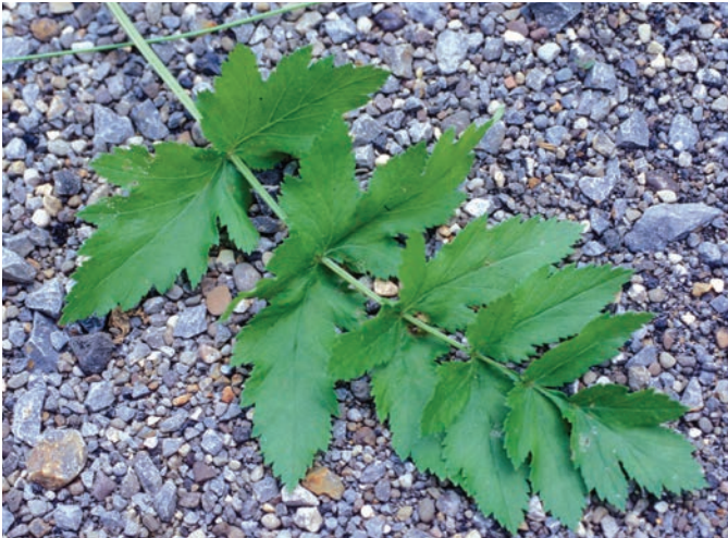
Compound leaves are arranged in pairs