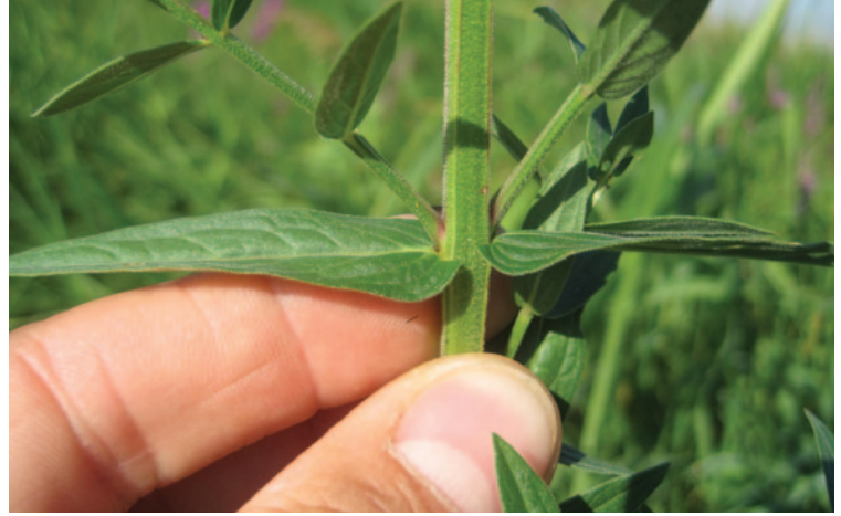
Stems are woody and square with opposite or whorled leaves.

Cette publication est également disponible en français.