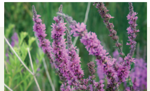
One horizontal underground stem can produce 30 to 50 erect stems.