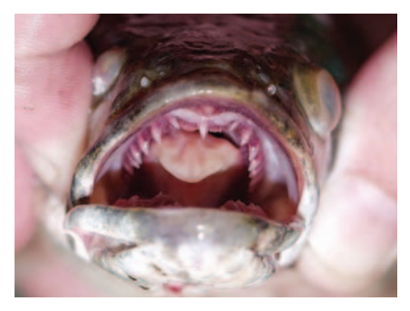
Northern snakehead has a mouthful of long, sharp teeth.

The northern snakehead is a voracious predator that lives in lakes, ponds, rivers and streams in water temperatures ranging from 0° to 30°C. It has been reported to travel on land for short distances by wiggling its body forward. A lung-like organ enables it to absorb oxygen by gulping air at the surface, allowing it to thrive in water that is low in oxygen and to survive out of water in moist conditions for up to four days.