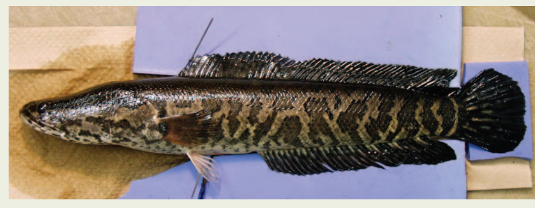
Northern snakehead.

The northern snakehead is a predatory fish native to southern and eastern Asia that is now found in several American states. The fish was likely introduced to the United States by people who bought live snakehead from fish markets or pet shops and later released them into lakes, rivers or ponds.