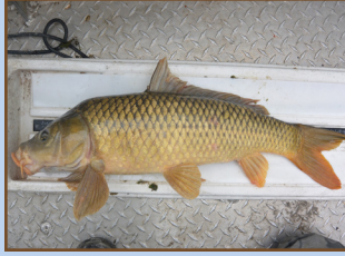
Common Carp with LONG dorsal fin and LARGE SCALES