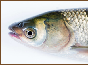
INVASIVE Grass Carp with JAWED mouth and NO BARBELS (whiskers). Eyes are low and sit in line with mouth

Invasive Carp Regional Coordinating Committee