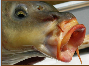
Common Carp with SUCKER mouth and BARBELS (whiskers). Eyes sit relatively high on the head