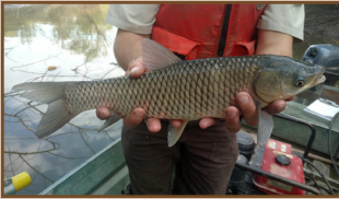
INVASIVE Grass Carp with SLENDER head and body

Invasive Carp Regional Coordinating Committee