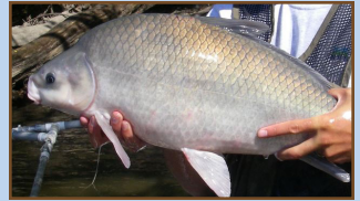
Smallmouth Buffalo with DEEP body