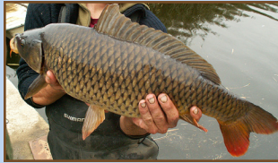
Common Carp with DEEP body