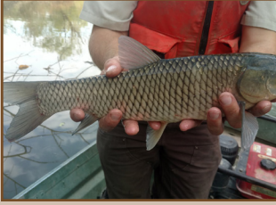
INVASIVE Grass Carp with SHORT dorsal fin and LARGE SCALES

Invasive Carp Regional Coordinating Committee