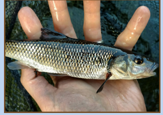
Fallfish with SHORT dorsal fin and MODERATE SCALES. Eyes sit relatively high on head