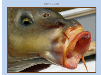
Common Carp with SUCKER mouth and BARBELS (whiskers). Eyes sit relatively high on the head