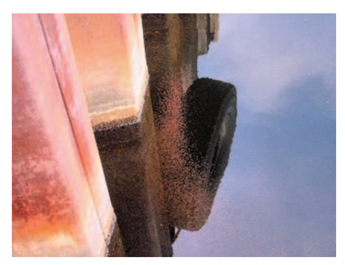
Swarm of bloody red shrimp.

The native opossum shrimp ( Mysis diluviana , formerly known as M. relicta ) is very similar, but when seen under a magnifying glass the opossum shrimp's tail is forked, while the bloody red shrimp's tail is square with two spines at the end.