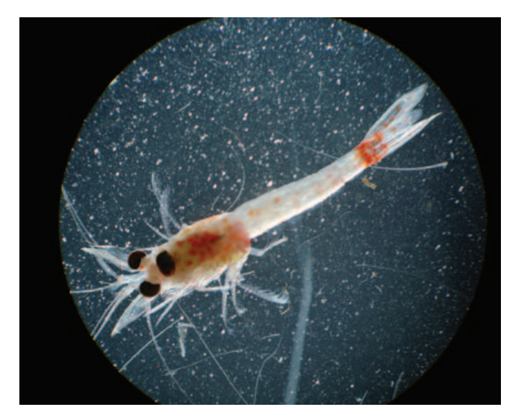
Large black eyes extend from the body on short stalks.