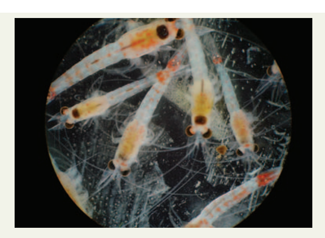
Cluster of bloody red shrimp.

This fact sheet may be reproduced for non-commercial purposes. © Queen's Printer for Ontario, 2012 Cette publication est également disponible en français.