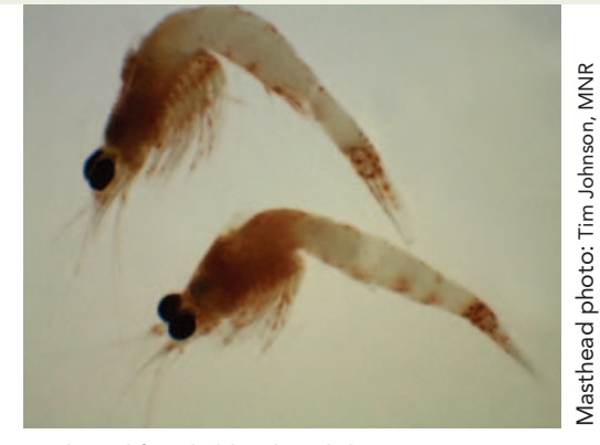
Male and female bloody red shrimp.

Scientists don't fully understand the impact of the bloody red shrimp on the Great Lakes, but believe its eating habits and ability to multiply rapidly could threaten native species.