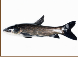
INVASIVE Black Carp with SHORT dorsal fin and LARGE SCALES

Invasive Carp Regional Coordinating Committee