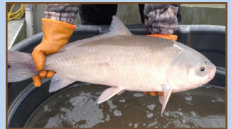
Bigmouth Buffalo with DEEP body