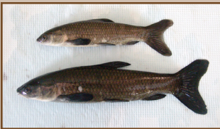
INVASIVE Black Carp with SLENDER head and body

Invasive Carp Regional Coordinating Committee