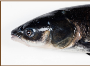
INVASIVE Black Carp with JAWED mouth and NO BARBELS (whiskers). Eyes are low and sit in line with mouth

Invasive Carp Regional Coordinating Committee