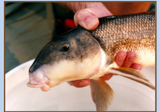
Sucker species (e.g. White Sucker, pictured) with SUCKER mouth and NO BARBELS (whiskers). Eyes sit relatively high on the head