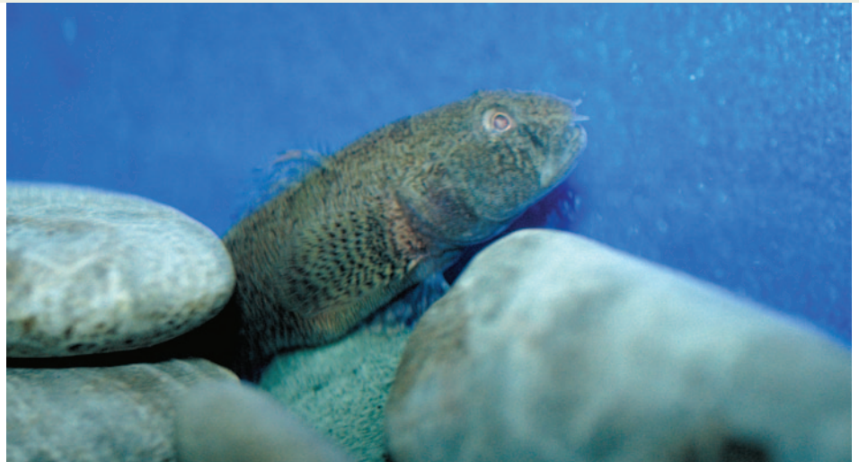
Tubenose goby.

Outside its native range, the tubenose goby is most abundant in the St. Clair River and Lake St. Clair. It is also found in Lake Erie, in Lake Superior at Thunder Bay, Ontario, and in Duluth Harbor, Minnesota. The fish has occasionally been sighted in the St. Lawrence River near Kingston, and in Lake Huron.