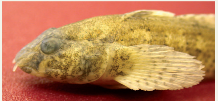
Tubenose goby has small nostril tubes that extend over the upper lip.