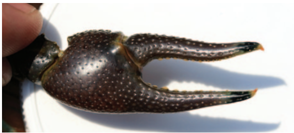
Rusty crayfish claw with black bands near the tips.

Rusty crayfish may be confused with species of crayfish that are found in Ontario, including the native northern clearwater crayfish ( O. propinquus ), the native virile crayfish ( O. virilis ), and the introduced obscure crayfish ( O. obscurus ). None of these species have a pinched rostrum, black claw bands, or rusty patches on the shell.