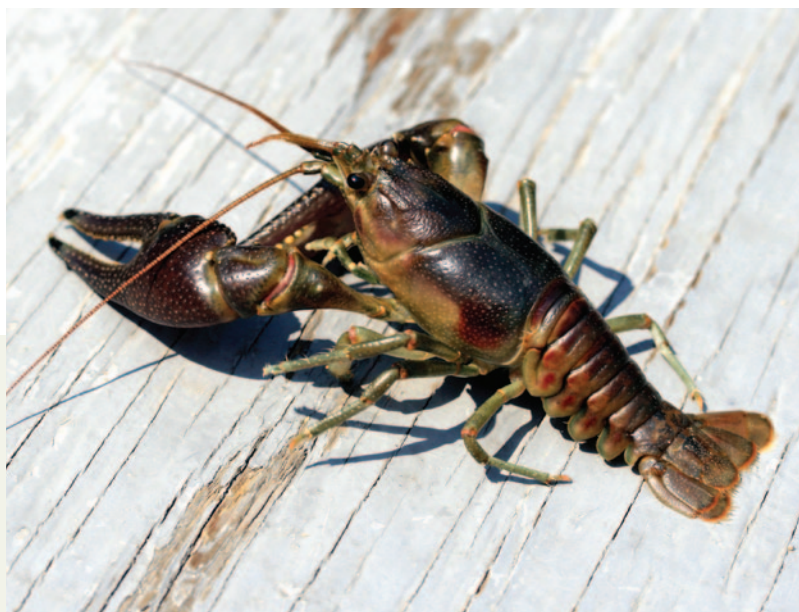
Rusty crayfish.