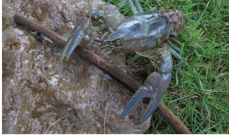
Rusty crayfish.

Cette publication est également disponible en français.