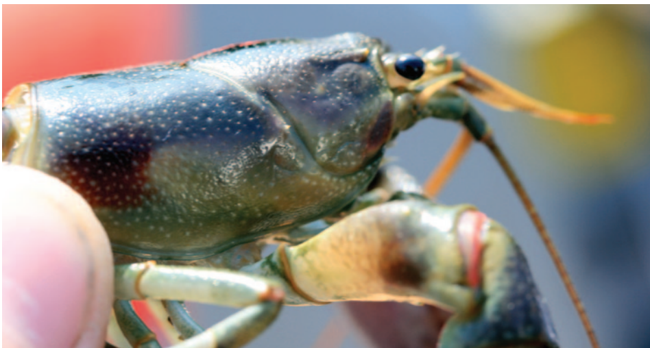
Rusty crayfish showing rusty patches.

To prevent the spread of rusty crayfish, Ontario prohibits the overland transport of all species of crayfish, both alive and dead. Crayfish can only be used for bait in the waterbody in which they are caught.