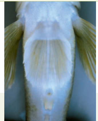
Fused pelvic fins act as a suction cup for the round goby.