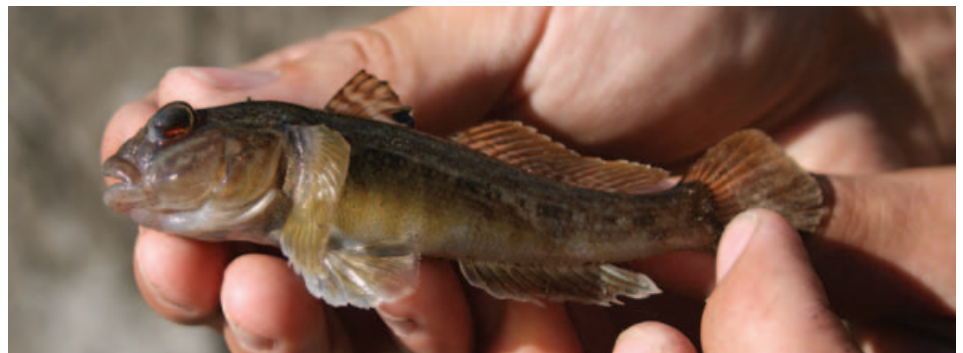
Small, bottom-dwelling round goby.

To prevent the spread of this invasive species, the Ontario government has banned the possession of live round goby and the use of round goby as a baitfish.